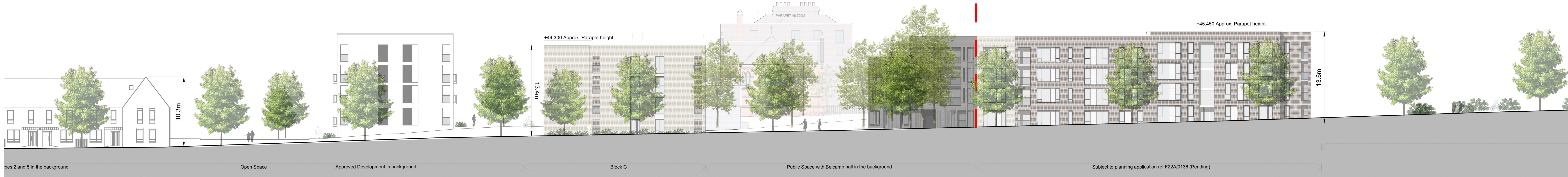
SECTION H-Continued 2/5