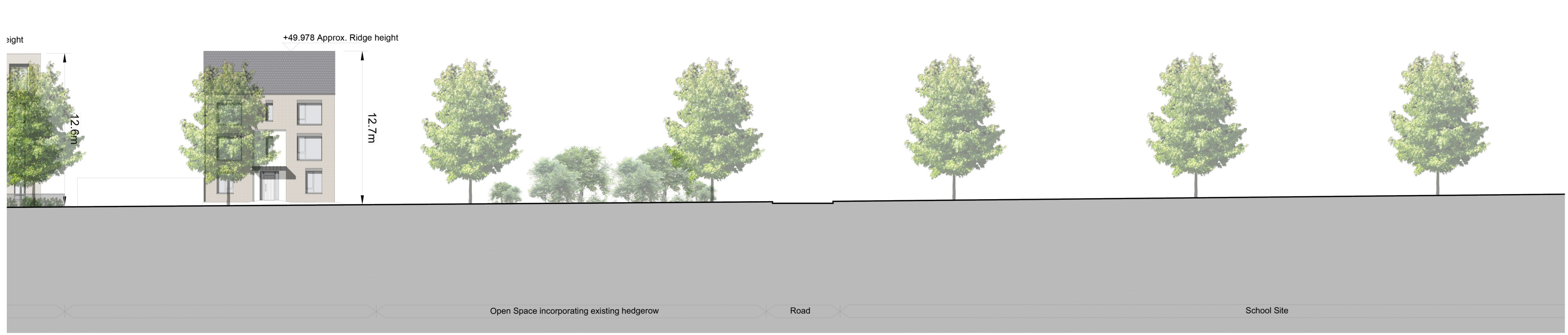
SECTION H-Continued 5/5