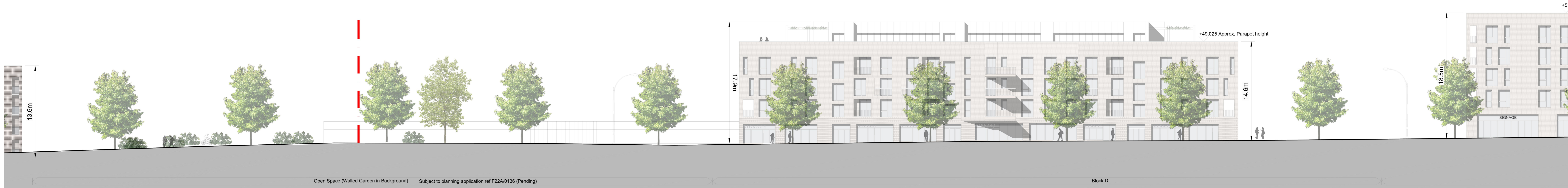
SECTION H-Continued 3/5