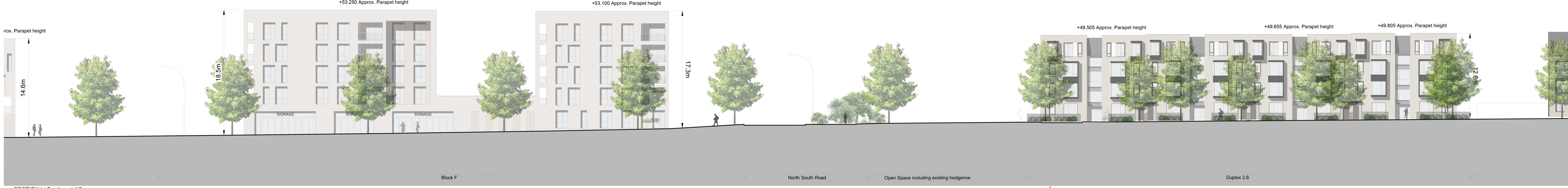
SECTION H-Continued 4/5